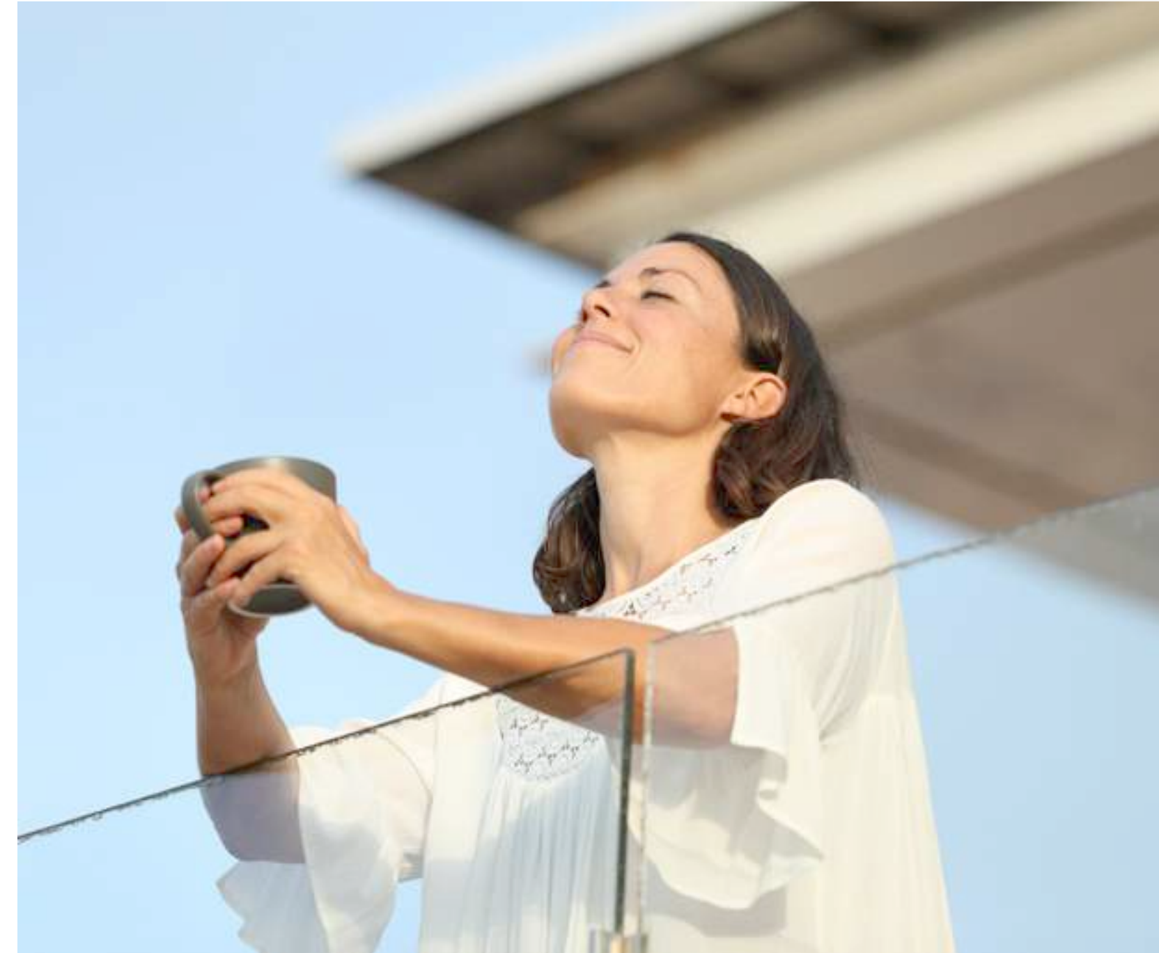
Sun shading elements (balconies & perforated panels)

Extensive landscaping with native plants or adaptable species enhances the property's beauty and value while reducing its environmental impact. Other environmentally friendly features include advanced waste management and water reuse solutions, as well as a bicycle storage area and EV parking to encourage residents to use less traditional combustion engines.