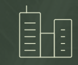
Dubai Hills Mall