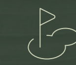
Dubai Hills Golf Club