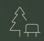
Dubai Hills Park

A city within a city – Dubai Hills Estate comprises elegantly planned neighbourhoods of contemporary apartment buildings and villa compounds in a country-village setting. This comprehensive community embodies the concept of comfortable living, with essential amenities close by and a world of retail, leisure and entertainment on the doorstep.